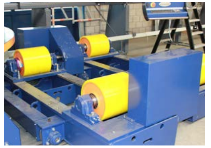
The supports can be motorised to easily move a shell along the rails.