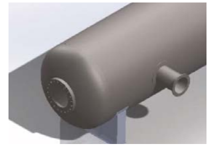
State of the art solid modelling CAD-CAM interfaces available for easy creation of cutting data by use of step files.